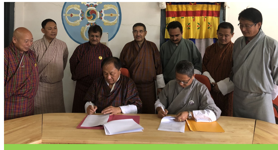
Signing of accreditation document by Chair person of Accreditation team and JNEC Presiden

On accrediting several colleges in the country, the accreditor team consisting of professionals from different organization were in Jigme Namgyel Engineering College from 13 – 16 November, 2017 to exercise accreditation activities. While in the College, series of meetings were conducted by accreditors with college management, academics, non-academic staff and students' representatives. The College also felt the need of such accreditation exercises for higher education institution specifically to assure standard collaboration and linkages with other international universities and stakeholders.