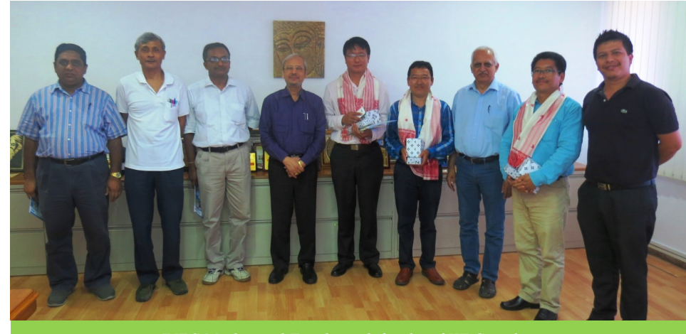
JNEC Mechanical Faculty with faculty of IIT Guwahati

team of three JNEC delegates, led by the Officiating Head of Mechanical Engineering Department, visited the Indian Institute of Technology (IIT) Guwahati, from 23<sup>rd</sup>-24<sup>th</sup> August 2017. The visit was aimed at building a formal relationship with the Institute, particularly in the field of Mechanical Engineering. The visit also targeted to identify the establishments, instrument, facilities and set ups required in the course work of Mechanical Engineering programme. The team from JNEC also visited the Mechanical Engineering Department Laboratories and Workshops, Central Library and Center for Energy, in their campus. The derivatives