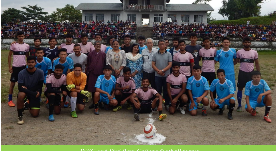
NEC and Shri Ram College football teams

The competitive match was played until the final whistle was blown at 10:10 AM declaring a draw with the scores 2-2. Although the match could not decide who the winner was but both the teams won the hearts of the viewers. After the match, the Shri Ram College's students left for Delhi via Guwahati.