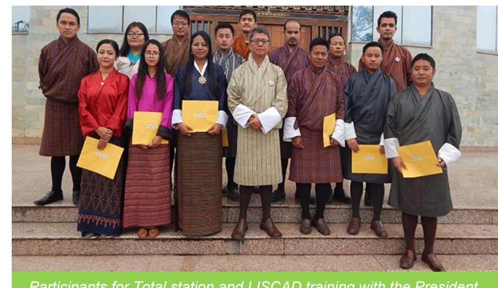
Participants for Total station and LISCAD training with the President.

The College has been offering specialized consultancy services and short term trainings in various disciplines. These training opportunities and courses facilitates basic and needful skills at various work fields for the general public, provides a platform for the faculty to impart their skills and also opens up doors to and from stakeholders for the college. JNEC conducted a training program on 'Surveying with Total Station and LISCAD' from 21st till 26th August, 2017 in the campus. The training was organised by Civil Engineering and Surveying Department which conjugated theoretical and practical