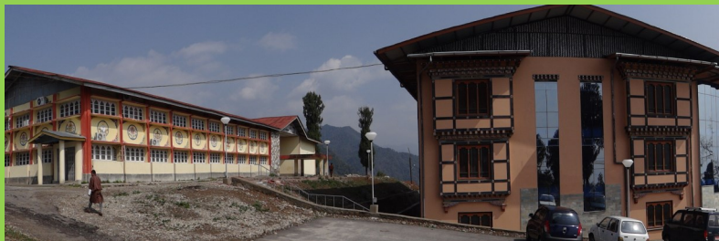
Jigme Namgyel Polytechnic, NOW as it stands

In pictures: Jigme Namgyel Polytechnic, NOW and THEN