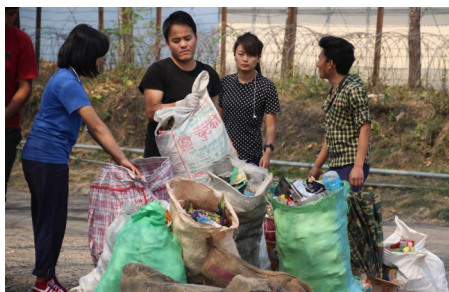
Students gathering waste for disposal

To commemorate the 60th Birth Anniversary of Fourth Druk Gyalpo Jigme Singye Wangchuck, the entire family of Jigme Namgyel Polytechnic (JNP) conducted a mass cleaning campaign on 20 th March, 2015 coinciding with the International Day of Happiness.