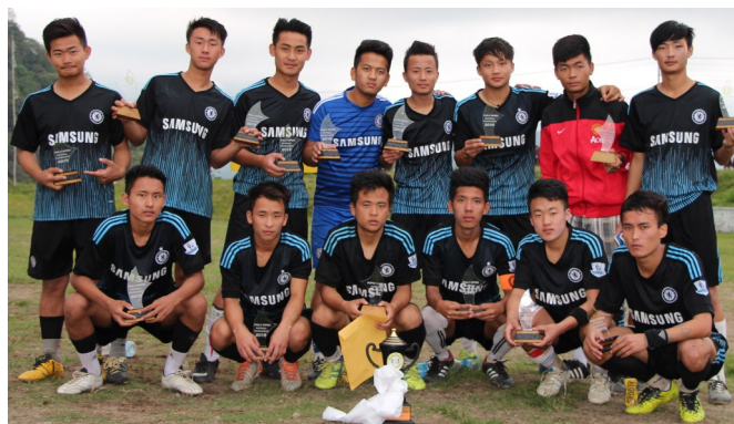
Dungsam Academy :The Champions of the Poly Open Football Tournament, 2015

Organizing such an event has been helpful in encouraging greater participation from growing youth. To ensure such participation, the entry fees for school and college teams were kept at reasonable rate. The tournament was one of the memorable dedications on the occasion of 60 th Birth Anniversary of His Majesty, the Fourth Druk Gyalpo with hope that such event will generate social harmony amongst the communities as one.