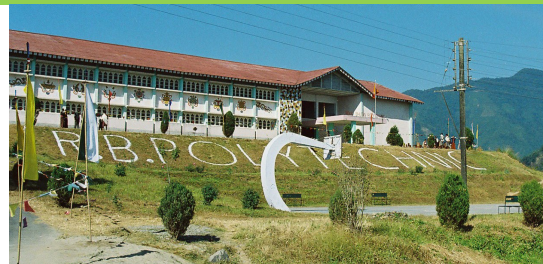
Jigme Namgyel Polytechnic during 1990's, THEN known as Royal Bhutan Polytechnic.