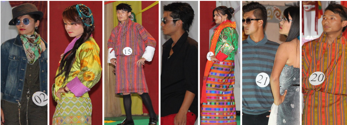
Participants in their best attire