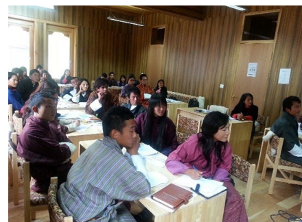
A moment during training session

Through rigorous activities, participants learnt to work as a team, share, refine and transform their ideas into structured forms. Participants were able to identify the characteristics of an effective leader and their leadership styles. By review of appropriate theories, the beneficiaries were able to obtain the deeper understanding of leadership and democracy.