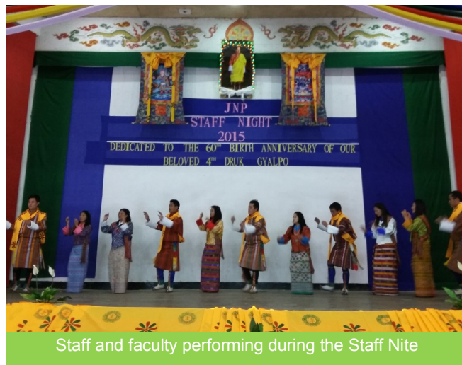
Staff and faculty performing during the Staff Nite

However the night became more special with the presence of entire students and people from the local community. The staff appreciated the trainees for being an important part of their life and the evening ended joyfully with a hope in each and every one's heart to welcome such events in near future.