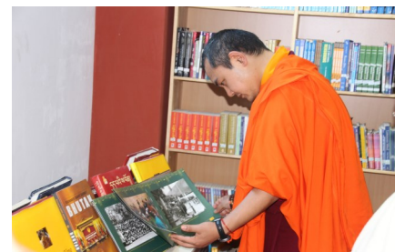
His Eminence browsing books in the Institute Library during the break

effective teachings that are part of our daily lives. His Eminence has indeed mentioned that he loves to talk with youth and indeed has inspired many. Institute also shared the hope for His Eminence’s guidance and visit in future.