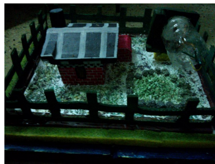
Model of theft and earthquake alarm

On exhibiting our innovative model during exhibition at Sherubtse College, our model got much acclaimed by media. Representing institute, we are satisfied for what we have designed after much effort. Out of 23 exhibitors, we bagged