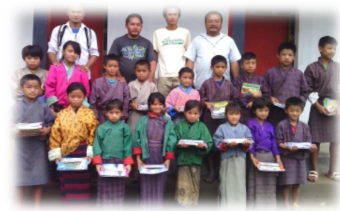
Helping Hand Members With Beneficiaries

The members' aims to create happiness to entire faces by helping those physically challenged and communities deprived of basic amenities. Basically the members work for the holistic benefit of the community. Every semester the club plans their activities and avail their helping hand wholeheartedly to entire under-