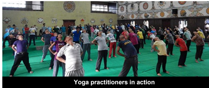
Yoga practitioners in action

He taught basics of yoga to the participants and also gave presentation on the importance of yoga and Food & Habits