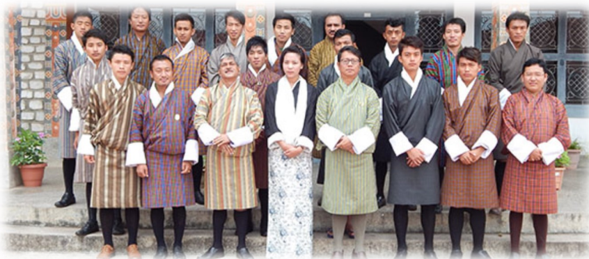
Elected Student Representatives with Director, Deans and Department Heads

Director said, "this is the special occasion to select the best leader who can help and work harder to bring the changes in the Institute". All the councilors have their own responsibility in