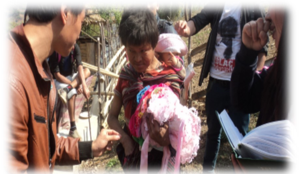
Members Distributing Clothes To Needy