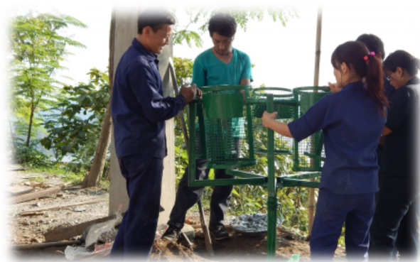
Students installing Waste Segregation Station

The main task for this project was carried out by a group of students pursuing Diploma in Mechanical Engineering at JNP as an academic project. The task included fabrication works where the raw materials were purchased from the