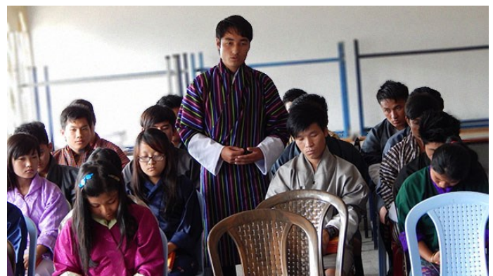
One of the Surveying student expressing his gratitude during the inaugural session of the programme