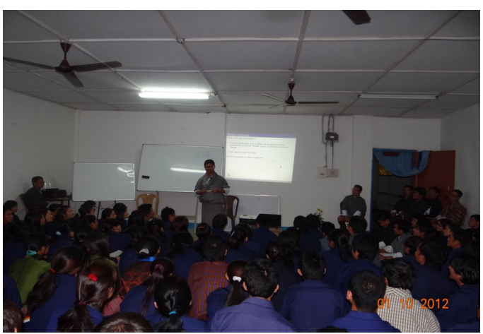
Staff and Trainees attending Workshop

A Human Value workshop for two weeks was held in Jigme Namgyel Polytechnic, Dewathang from 1st to 15<sup>th</sup> September, initiated by eight staff members of JNP including the Director. All eight staff members shared that they are presently practicing and following the human value after attending the workshop on human value and professional ethics at Gaeddu College of Business