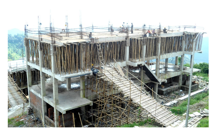
Constructions under process

With the increasing number of students every year in the campus, the scarcity of dwellings for staff and trainees of the institute is in deficit state where it has become a necessary challenges for the management of the Institute to overcome these needs in comforting its family. As an answer to this issue now the Institute is under the process