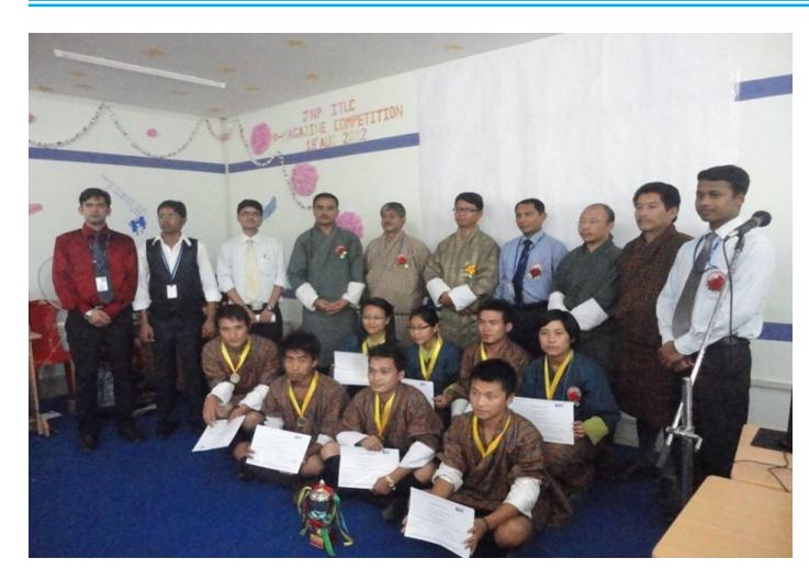
Wining Group with Director, IT and NIIT staff

On 18th of August ITLC emagazine competition was held at Jigme Namgyel Polytechnic under the project of "Chiphen Rigpel" of NIIT. ITLC is a center which gives IT education to all the enthusiast and here in JNP many student and staff participated in various events organized by ITLC. Students were taught "ITFOPT, RDD. LBEPS, TMPC, ADOBE PHOSHOP AND FLSH(CS 5.5), PHOTO ALBUM, MUL-TIMEDIA FOUDATION, FUNDAMENTALS OF