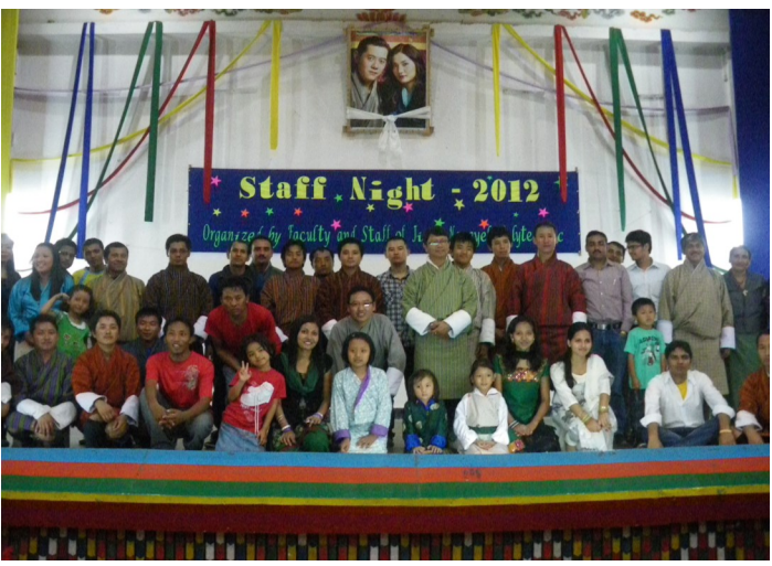
JNP staff and families

As sung in the lyric, 'Give me some sun shine, give me some rain, give me another chance that I can grow up once again.' This phrase, relates to this particular night which is conducted once in a blue moon in the institute. It is supposed to be one of the great and jovial moments compared to the rest of the