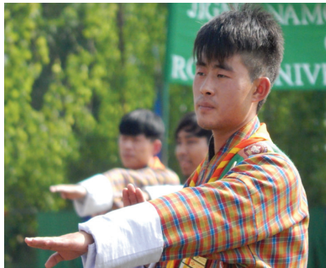
Scout taking oath

Rovers around the world are celebrating 100 years of Rover Scouting in 2018. The year 2018 marks a decade of Rover scouting in Jigme Namgyel Engineering College. Developing the significance of the “Rovers Centenary” and “Decade of Rover Scouting in the college” the Rover Scouts embarked on fund raising event for the community development initiative with the target to generate the amount of 100 hundred thousand within the time frame of 100 days. On September 26, 2018, the Rover Scouts of