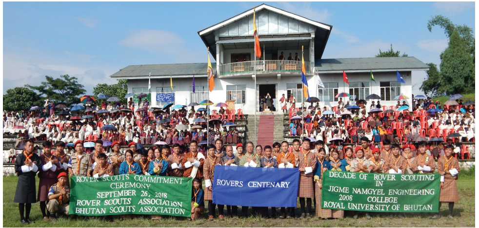
Rover scout photo session with the DSA, President, and scout leaders

the College observed the day highlighting the importance of the event. The Rover Scouts commitment ceremony was aligned with the event. The new recruits were honored with the membership badge and scarf recognizing individuals successful training and the achievement.