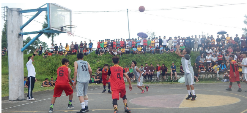
Boys playing Basketball during BUSF between Team JNEC versus Team GCIT

On the 1 st September, 2018 the BUSF was held in Jigme Namgyel Engineering College with great eagerness, excitement and playful atmosphere. The match was played between two colleges, JNEC and Sherubtse College and the two-team competed in tournaments including Basketball, Football and Volleyball. The volleyball and basketball match played among the boys of the two team was epic with both teams working hard to earn points for their team. However, the match was won over by the Team Sherubtse. The boys Team JNEC put forth valiant efforts to defend during the boys’ football match and they won the match against the Team Sherubtse. For the match among the girls of the two team, Team JNEC won the tournament in basketball and football but except for the volleyball, Team Sherubtse won the game in a great vigor. The tournament