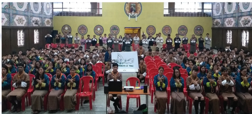
Staffs and students during the International Day of Peace

The Roverscouts of the college coordinated in observing the International Day of Peace on 21 st September, 2018. The