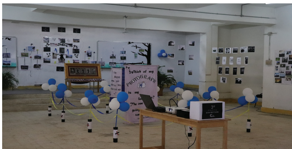
Seminar hall during Photo Exhibition

JNEC Media Club organized the second Photo exhibition on the 5 th of September, 2018 based on the theme "Life in JNEC." It is one of an annual event for the club