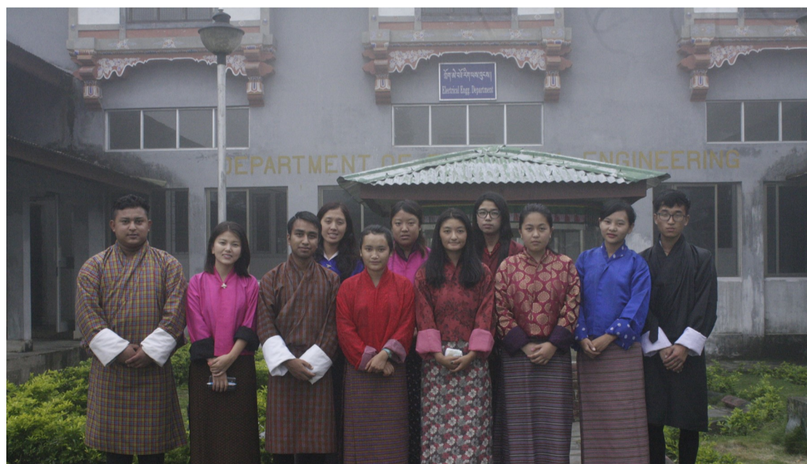
Student members of Publication Unit