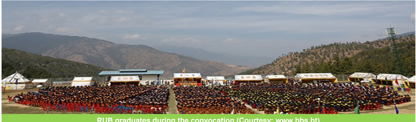
RUB graduates during the convocation