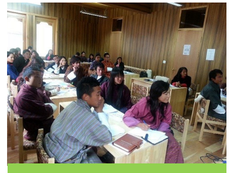
A moment during training session

Through rigorous activities, participants learnt to work as a team, share, refine and transform their ideas into structured forms. Participants were able to identify the characteristics of an effective leader and their leadership styles. By review of appropriate theories, the beneficiaries were able to obtain the deeper understanding of leadership and democracy.